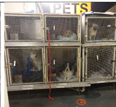
Kennels in centre of ship near stairwells – Deck 5.