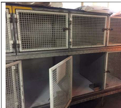
Kennels in centre of ship near stairwells – Deck 5.

To be honest, the single or double stacked “kennels” will be or could be very different from the sleeping arrangements that your dogs may be used to, but if they are crate trained that is a bonus. However, the kennels are clean, roomy, well ventilated, not smelly, have large water bowls and are checked through the night, at least four times during the trip. The kennels vary in size but as a guide the approximate measurements are: 700mm wide x 800mm high x 900 mm deep. On our way home this time we discovered large single kennels the same height as the double stacked kennels near the rear of the ship adjacent to the double stacked kennels. Our anxiety was replaced with relief after that first crossing and over time now have the planning of the trip with dogs pretty well organised.