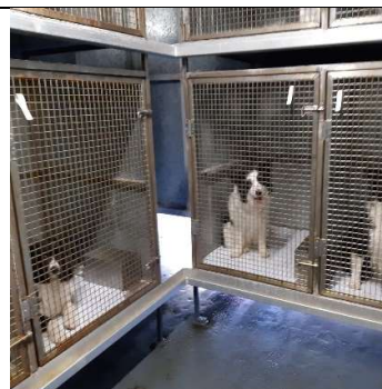
Kennels at the rear of the ship on port side – Deck 5. Large single kennels are adjacent.