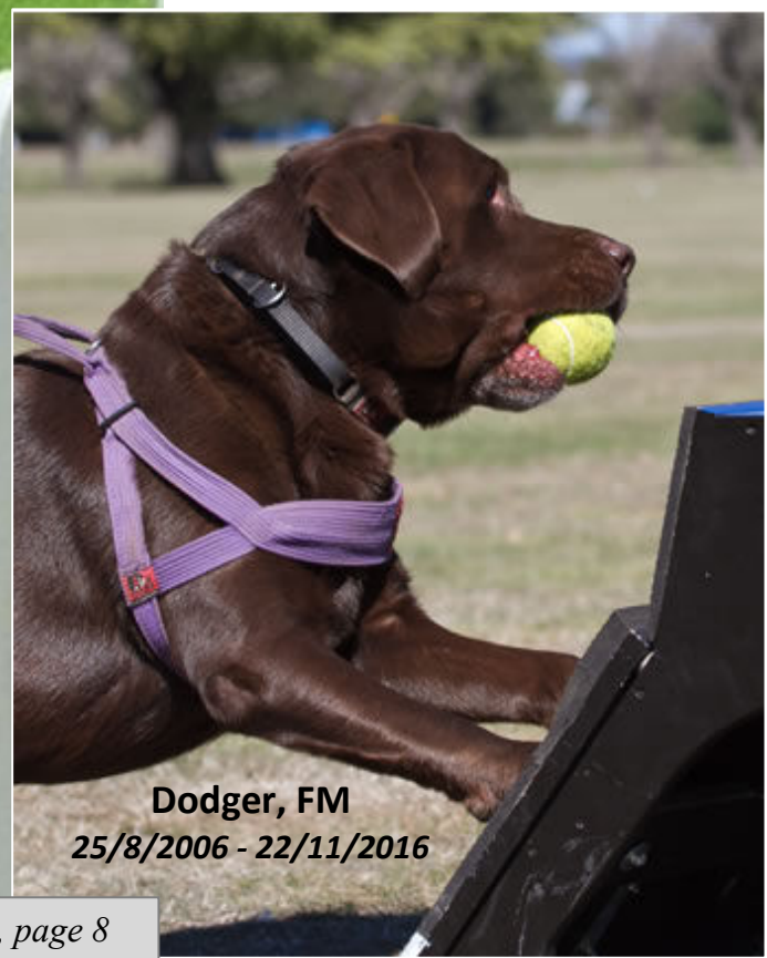
Dodger, FM 25/8/2006 - 22/11/2016