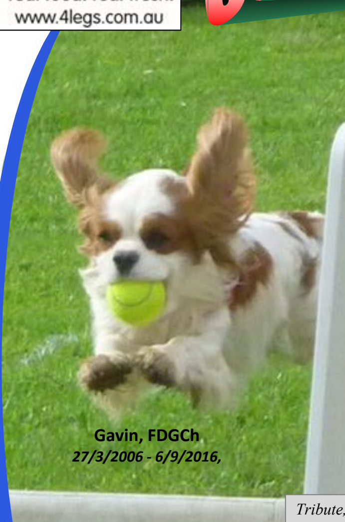
Gavin, FDGCh 27/3/2006 - 6/9/2016,